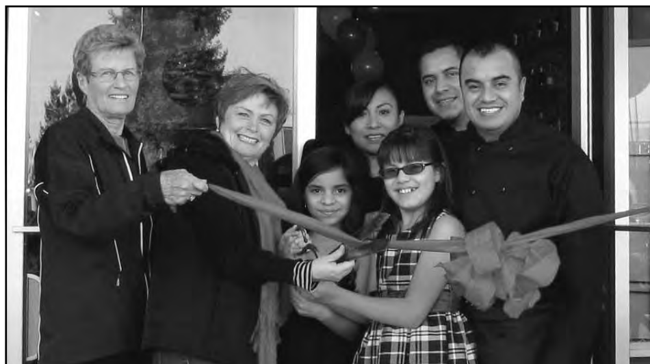
The Ribbon Cutting at the Paradise Sushi Bar & Grill was enjoyed by all.

Call 762-2785 for more sponsor information.